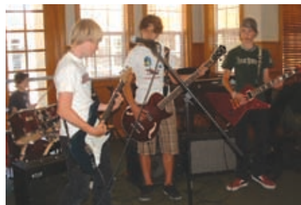
Ross Middle School band members perform at Cedars

“Ross is a pretty undiverse place and getting to spend time with Cedars residents was definitely something new for my friends and me. No one made fun of anyone. I think spending time together